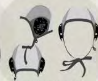
WATER POLO CAP