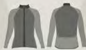
LONG SLEEVE CYCLING JERSEY