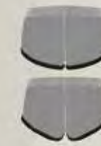
MALE SPLIT TRACK SHORTS