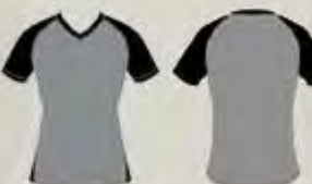
FITTED ATHLETIC SHIRT V NECK