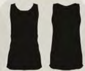
MESH REVERSIBLE TANK