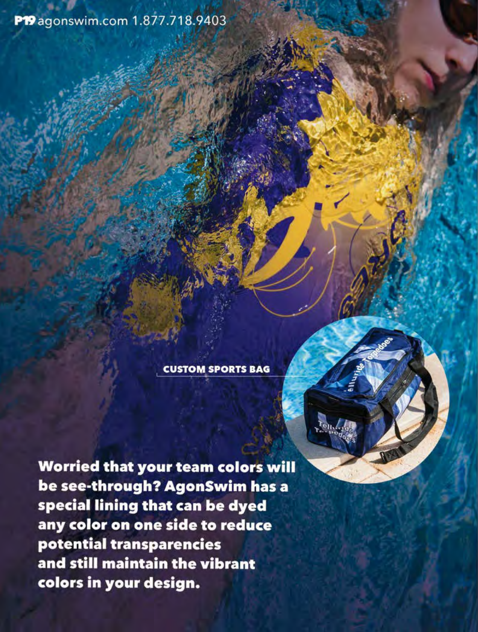
CUSTOM SPORTS BAG