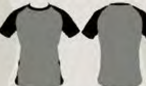
FITTED ATHLETIC SHIRT CREW NECK