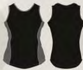
FEMALE TRACK SINGLET