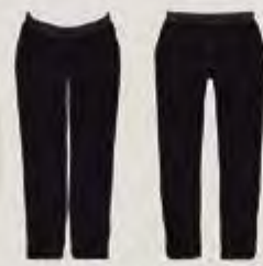
WARM - UP PANTS MALE