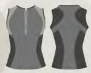
FEMALE ZIPPER SINGLET