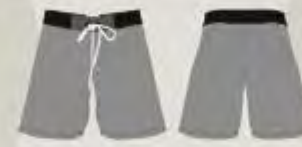
BOARD SHORTS FEMALE