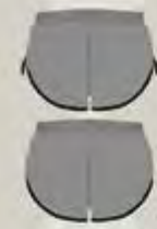
FEMALE SPLIT TRACK SHORTS