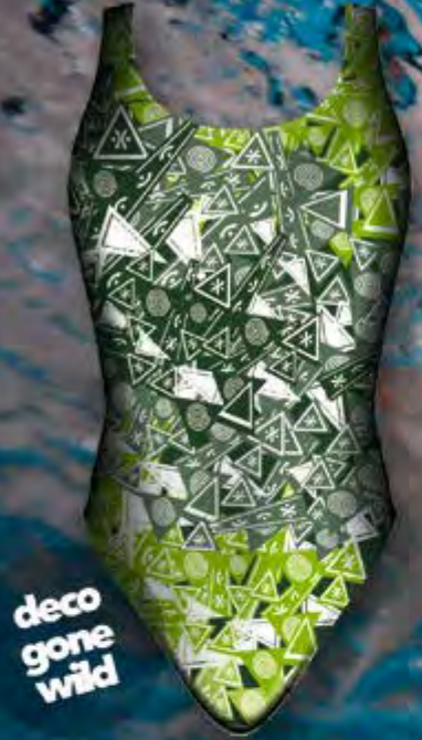
deco gone wild