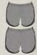
FEMALE RUNNING SHORTS