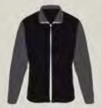
WARM - UP RELAXED JACKET FEMALE