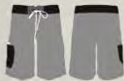
BOARD SHORTS MALE 19 INCH OUTSEAM