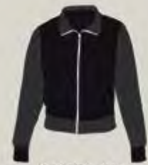
WARM - UP JACKET MALE