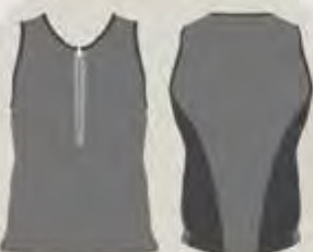
MALE ZIPPER SINGLET