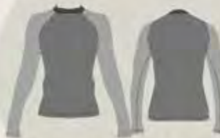
RASH GUARD LONG SLEEVE