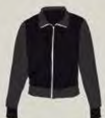
WARM - UP JACKET FEMALE