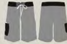
BOARD SHORTS MALE 21 INCH OUTSEAM