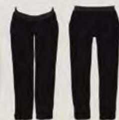
WARM - UP PANTS FEMALE