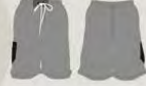
BOARD SHORTS ELASTIC WAIST