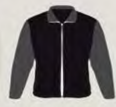
WARM - UP RELAXED JACKET MALE