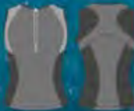
FEMALE ZIPPER SINGLET