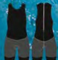
TRISUIT PANELS BACK ZIPPER FEMALE