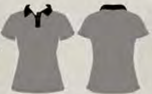
FITTED ATHLETIC WOMEN POLO SHIRT