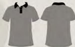
FITTED ATHLETIC MEN POLO SHIRT