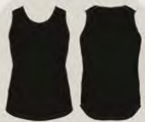
MALE TRACK SINGLET