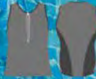
MALE ZIPPER SINGLET