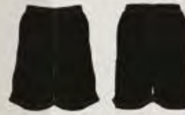
SHORTS 6 INCH INSEAM