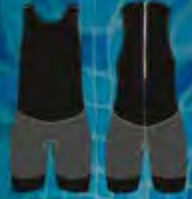
TRISUIT PANELS MALE