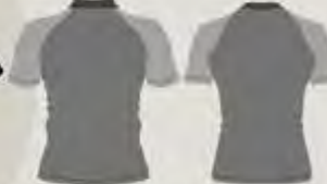
RASH GUARD SHORT SLEEVE